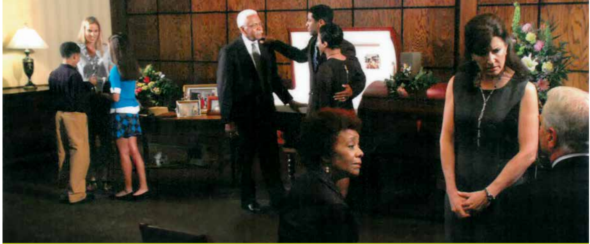
The Lincoln family is having a complete service followed by cremation.

The practice of cremation dates back to ancient times. Today it is more common in western Europe and Japan than in the United States and Canada. However, the number of people in the U.S. and Canada selecting cremation as the form of final disposition has risen significantly during the past few years.